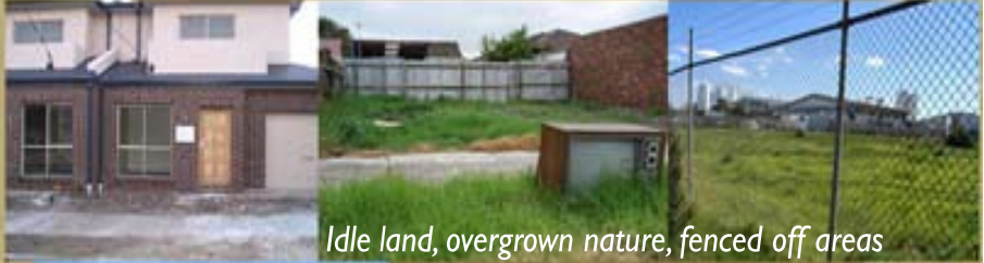
Idle land, overgrown nature, fenced off areas

- a good idea is to survey the area first using 'Google Earth' technology, this will reveal vacant blocks of land.